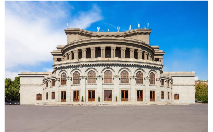
Opera and Ballet Theatre