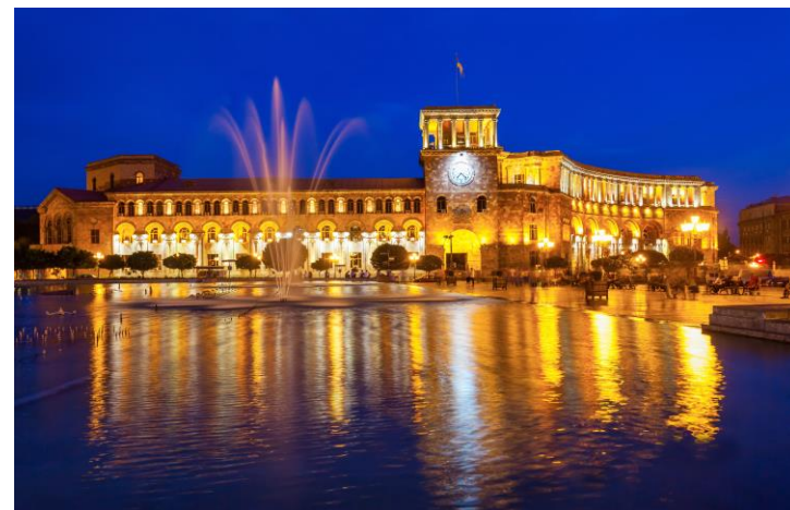
The Republic Square